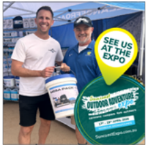
Social Media Post 1