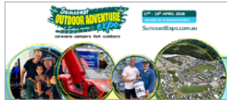
Facebook Cover 1