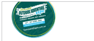
Facebook Cover Template 1