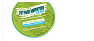
Facebook Cover Template 2