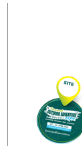
Social Media Story Template