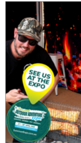
Social Media Story