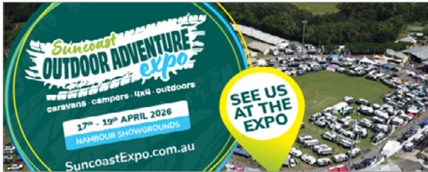
Email Signature 1