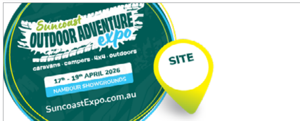
Email Signature Template 1