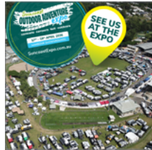
Social Media Post 2