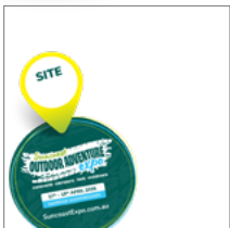
Social Media Post Template 1