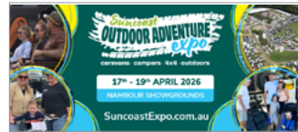
Facebook Cover 2